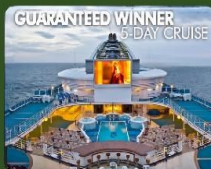
Men's Longest Drive Prize