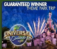
Closest to the Pin Prize