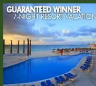
Women's Longest Drive Prize