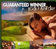
Longest Putt Prize